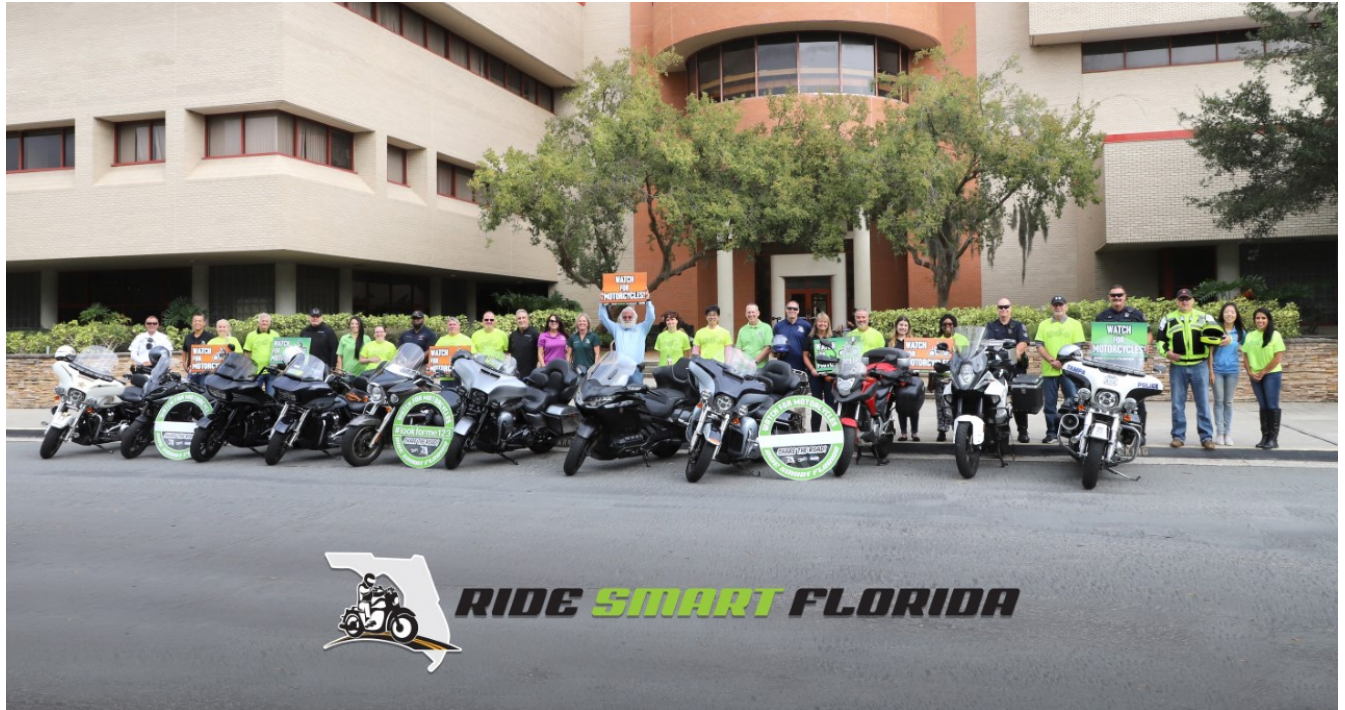
Figure 1. November 2022 Coalition Member group photo