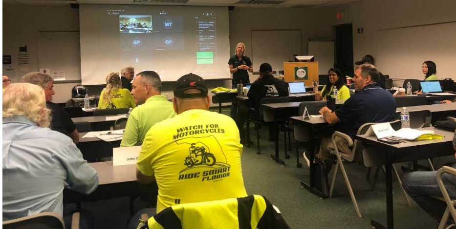
Figure 8. Emphasis Area Group Report Out