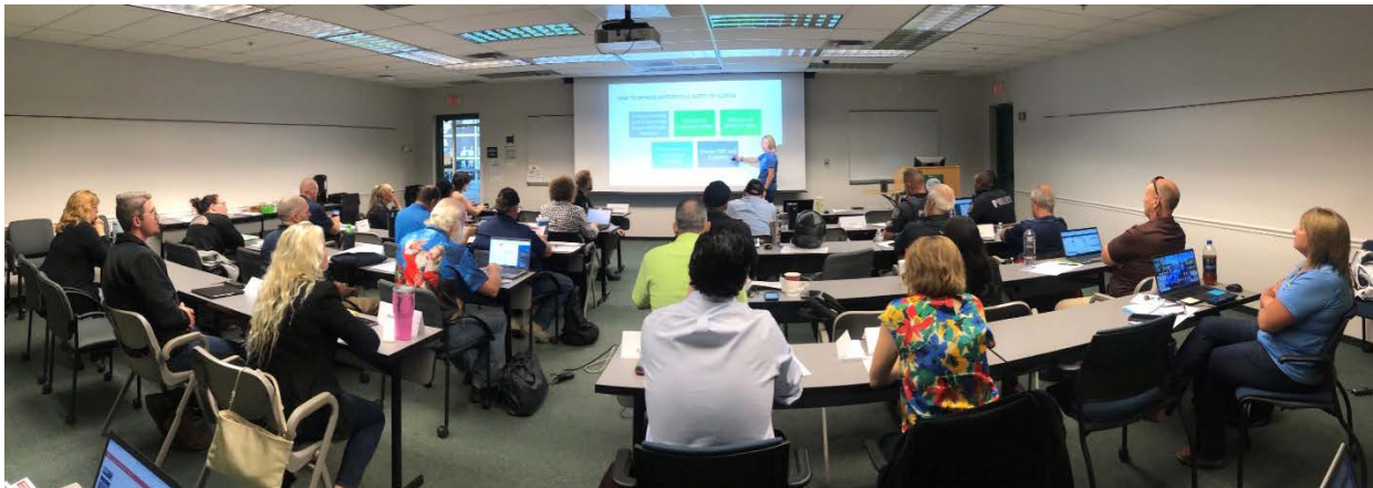
Figure 1. November 2023 Florida Motorcycle Safety Coalition Meeting, Day 1.